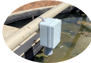
Ultrasonic water level sensor mounted on stock tank

A well calibrated user-friendly precision ranching system could aid ranchers in making rapid decisions to monitor and address water supply issues, using real-time data. A precision ranching system could also help reduce the financial and environmental costs of ranching and increase the operational efficiency of rangeland cow-calf systems. For example, rough calculations for the USDA-ARS Jornada Experimental Range, a 300-section ranch in southern New Mexico, suggest that wireless sensors monitoring water levels in troughs could save up to 480 hours of driving time and up to 960 gallons of fuel per year – which would translate into cost savings of approximately $10,000 annually (not including vehicle wear and tear and maintenance). The use of water sensors in this case could make this ranching operation more environmentally friendly by avoiding approximately 8.5 metric tons of CO2 emissions per year, and would free up valuable time that a rancher could use to pursue other endeavors.