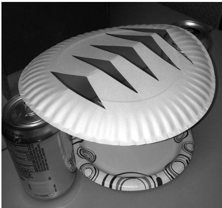
Figure 1. Experimental set up of shade treatment with plates and soda cans