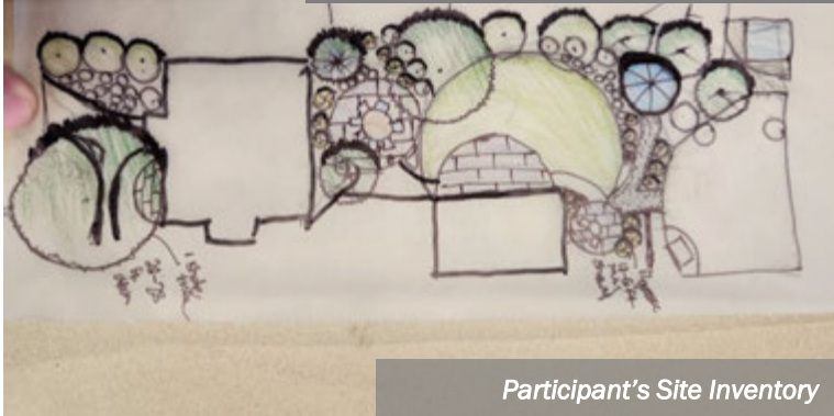
Participant's Site Inventory

USU's Center for Water Efficient Landscaping installed water-wise landscapes in a new housing complex in Cedar City, and created the Main Street Water-Wise Demonstration Garden.