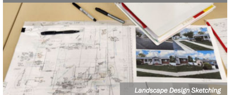
Landscape Design Sketching