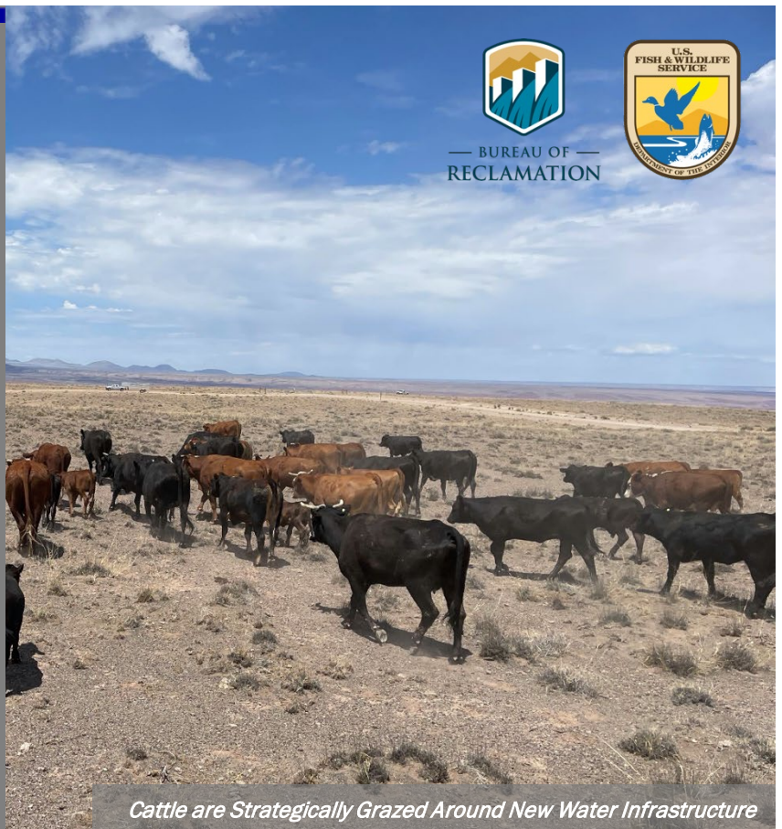
Cattle are Strategically Grazed Around New Water Infrastructure