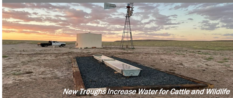
New Troughs Increase Water for Cattle and Wildlife