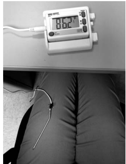
Figure 1. Example thermometer set up