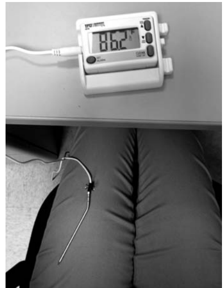
Figure 1. Example thermometer set up