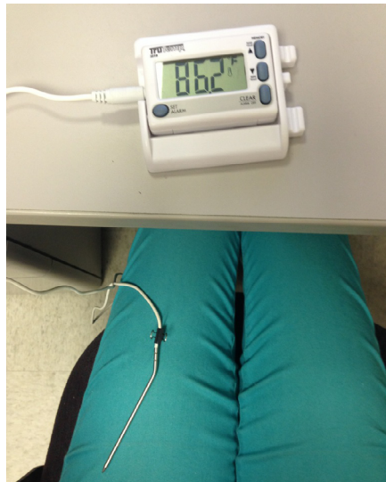
Figure 3. Meat thermometer set up

probe should not be pointed sideways or hanging off of the student's lap.