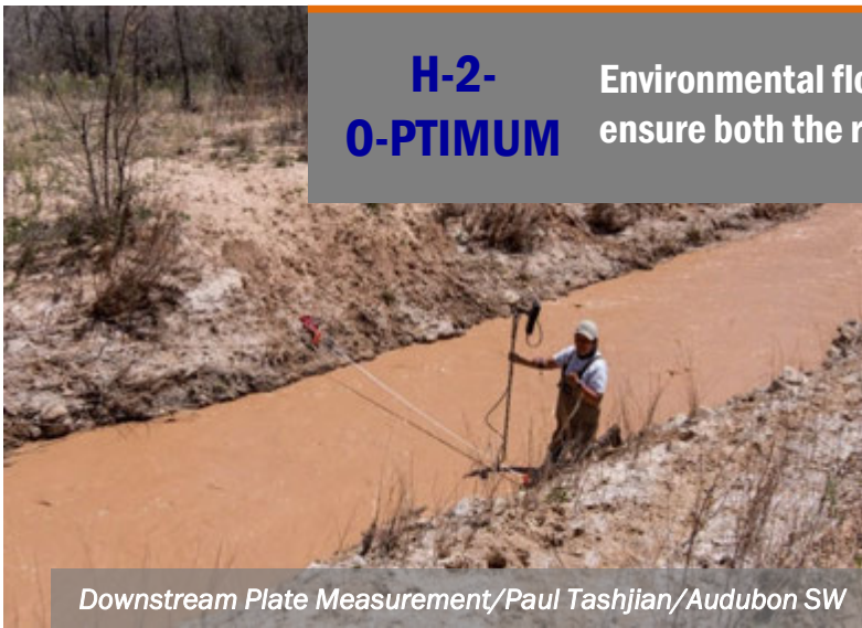
Downstream Plate Measurement

Environmental flow programs work within state water laws to ensure both the river and water users benefit from solutions.