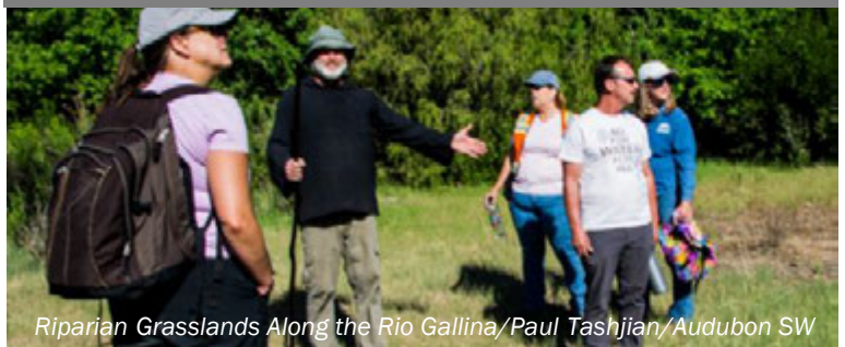
Riparian Grasslands Along the Rio Gallina