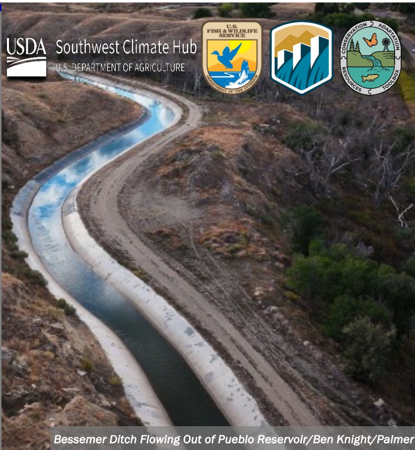
Bessemer Ditch Flowing Out of Pueblo Reservoir/Ben Knight/Palmer