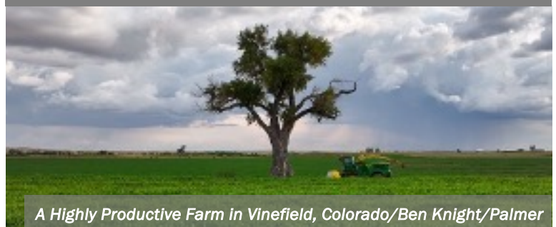
A Highly Productive Farm in Vinefield, Colorado/Ben Knight/Palmer