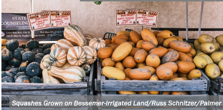
Squashes Grown on Bessemer-Irrigated Land/Russ Schnitzer/Palmer

Palmer produced and regularly screens the short film Mirasol , showcasing Pueblo County's diverse farming community and rich agricultural heritage, harnessing the power of storytelling to connect people to their local food systems.