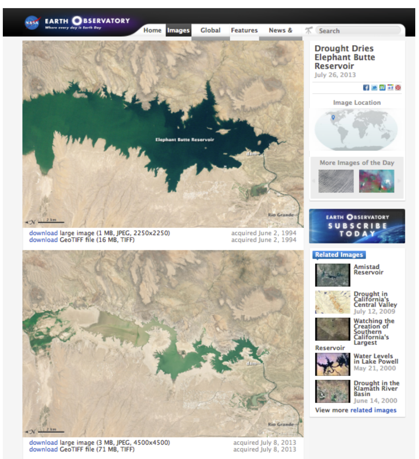
Figure 3. Lowered reservoir levels during drought, Elephant Butte, New Mexico