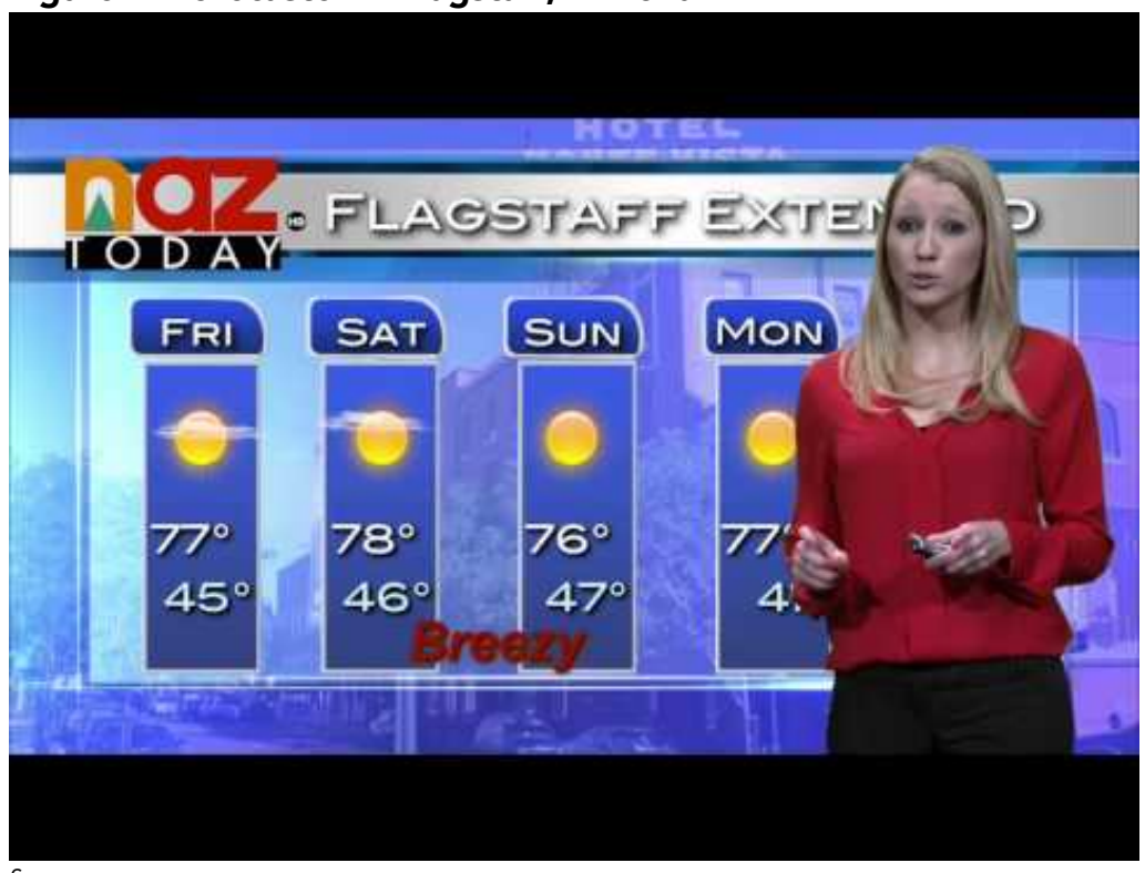
Figure 1. Forecaster in Flagstaff, Arizona