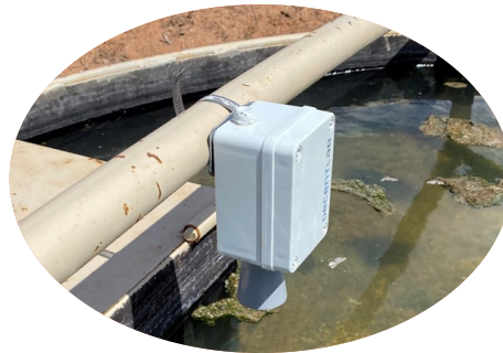
Ultrasonic water level sensor mounted on stock tank

A well calibrated user-friendly precision ranching system could aid ranchers in making rapid decisions to monitor and address water supply issues, using real-time data. A precision ranching system could also help reduce the financial and environmental costs of ranching and increase the operational efficiency of rangeland cow-calf systems. For example, rough calculations for the USDA-ARS Jornada Experimental Range, a 300-section ranch in southern New Mexico, suggest that wireless sensors monitoring water levels in troughs could save up to 480 hours of driving time and up to 960 gallons of fuel per year – which would translate into cost savings of approximately $10,000 annually (not including vehicle wear and tear and maintenance). The use of water sensors in this case could make this ranching operation more environmentally friendly by avoiding approximately 8.5 metric tons of CO2 emissions per year, and would free up valuable time that a rancher could use to pursue other endeavors.